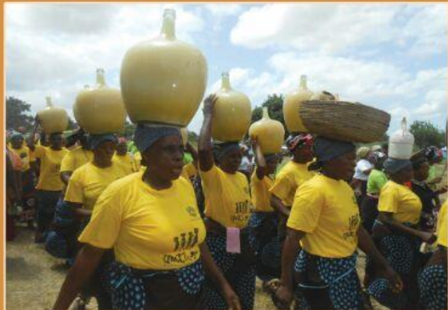
TRADITIONAL BEER FESTIVAL TOURS

We have so many things to free your soul and to enrich your mind with peace and joy in South Africa & neighbouring countries. Nature in destinations like: Jozini/Mkhuze, Kosi Bay, Hluhluwe, St. Lucia, Ulundi/Nquthu & Drakensberg, we arrange special events like Valentine's day, Reeds festival & special full day Jikeleza tour and uMthayi day visit, tours to whole RSA & SADC countries-(passport required)